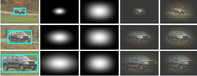
Figure 1. Gaussian and cosine window filtering raw pixel value example. The tracked region has a size of (175 \times 113) . First column: same regions with targets at three different scales (i.e., small (56 \times 32) , medium (110 \times 61) , large (164 \times 83) . Second column: Gaussian windows according the target size (i.e., small (\sigma_w = .32, \sigma_h = .28) , medium (\sigma_w = .63, \sigma_h = .54) , large (\sigma_w = .94, \sigma_h = .73) ). Third column: cosine window for all the three examples (i.e., size (175 \times 113) ). Fourth and fifth columns: images filtered with Gaussian and cosine windows respectively. Figure shows how the fixed cosine window fails to represent the target compared to the Gaussian windows. The cosine window includes background for small targets and discards information for big targets.